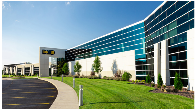
DMP home office in Springfield, Missouri

DMP is the No. 1 choice for business security systems among financial institutions such as banks and credit unions, for national retail security and for the U.S. government. Based in Springfield, Missouri, DMP has designed and manufactured its products in the USA for more than 40 years and is a privately held company whose only business is focused on electronic security solutions for commercial and business applications. The nation's best systems integrators choose DMP as their choice for intrusion alarm systems, access control and wireless security solutions for multi-location security solutions.